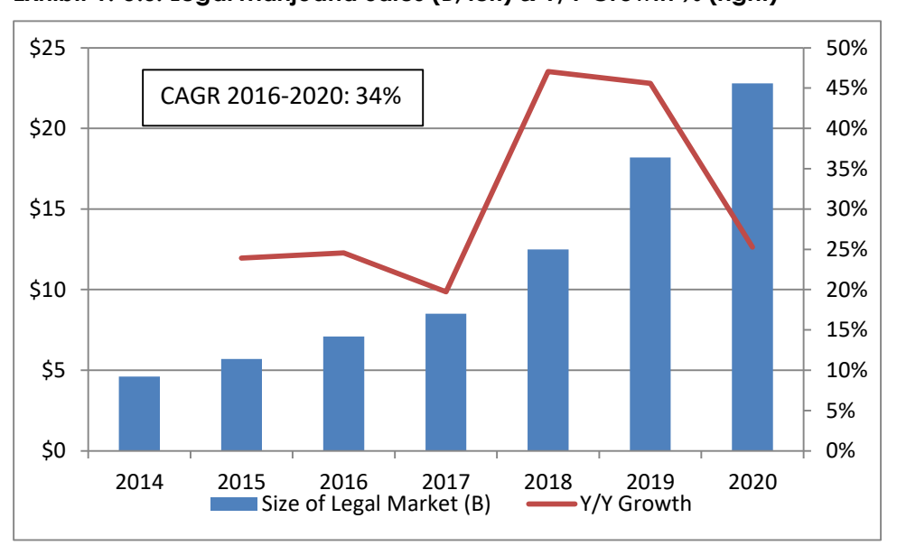
Exhibit 1. U.S. Legal Marijuana Sales (B, left) & Y/Y Growth % (right)

Source: 2016 Arcview Market Research & New Frontier, Beacon Securities.